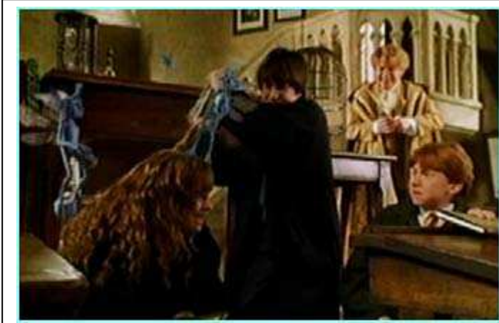
Pixies Attack (Heyman & Columbus, 2002)

Chamber of Secrets also introduces Professor Gilderoy Lockhart, the new Defense Against the Dark Arts instructor. He provides an outstanding example of how not to run a technology class, illustrating these guidelines: