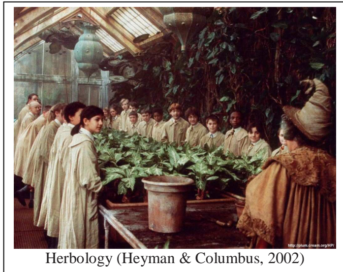
Herbology (Heyman & Columbus, 2002)