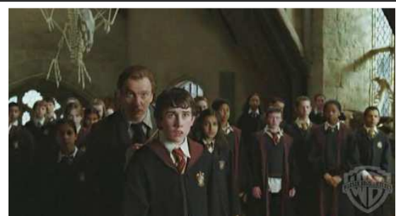
Boggart Class (Columbus et al, 2004)

The last (so far) film in the series, Harry Potter and the Prisoner of Azkaban (Columbus, Heyman, Radcliffe & Cuaron, 2004), shows us Lockhart's successor, Professor Remus Lupin, who quickly becomes one of Hogwarts' most beloved faculty members. A class on how to deal with a shape-shifting "boggart" illustrates his lively teaching technique. Lupin relies on three key principles: